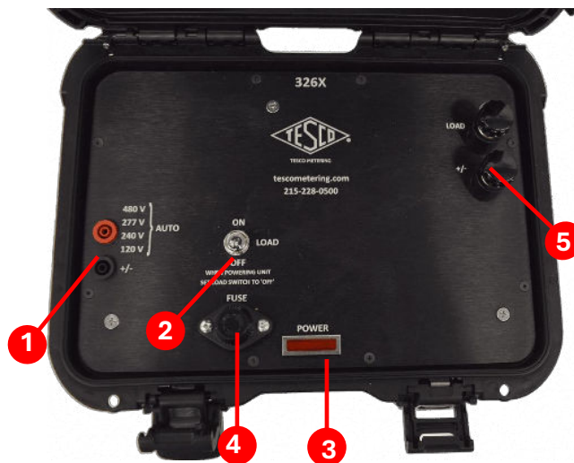
Figure 3.2.1 326X Front Panel

Each component is mechanically reinforced and rated for field conditions.