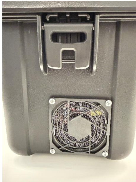
Figure 2.4.1 Cooling fan on the side of the unit.