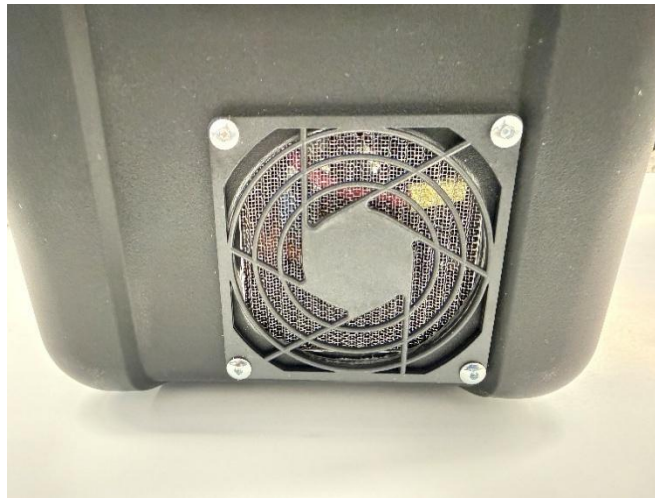
Figure 4.4.1 Cooling Fan for the 326X