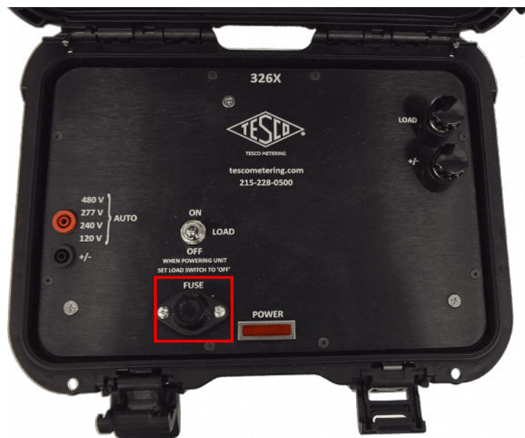
Figure 4.2.1 Panel Mounted Fuse

If the new fuse immediately fails, inspect voltage connections and wiring before continuing operation.