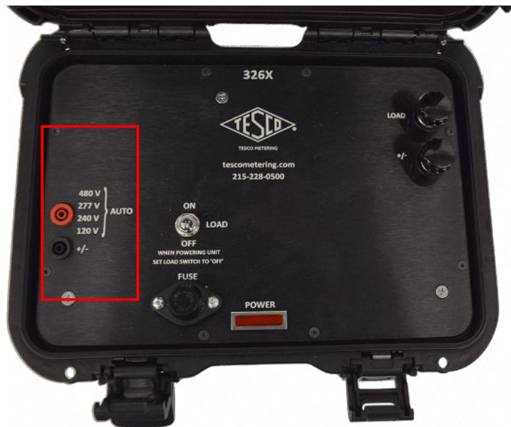
Figure 2.5.1 Voltage Input Connections on the unit.

Apply voltage according to approved electrical safety procedures. Once connected, the load switch can be used to apply load.