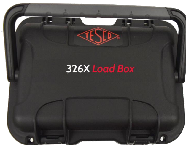
Figure 2.2.1 326X Load Box Case

A packing list may be included with the shipment. Ensure that any accessories or added items are accounted for.