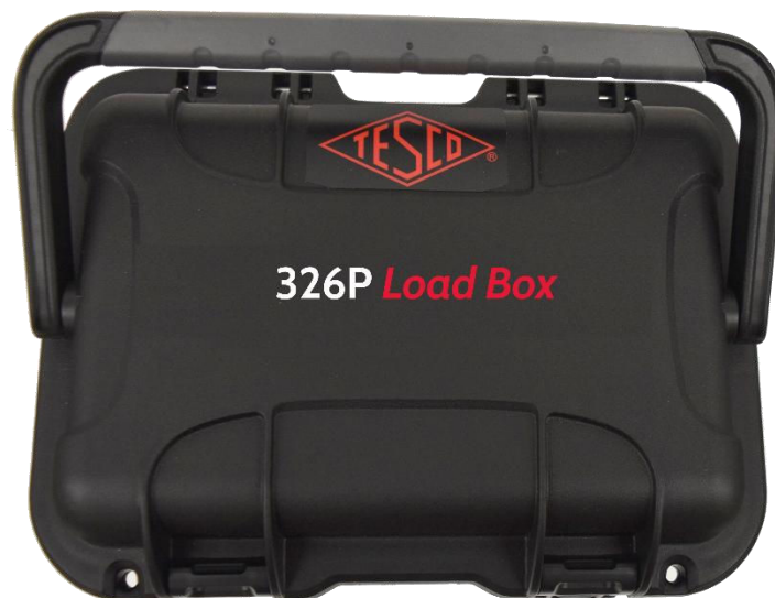
Figure 2.2.1 326P Load Box Case