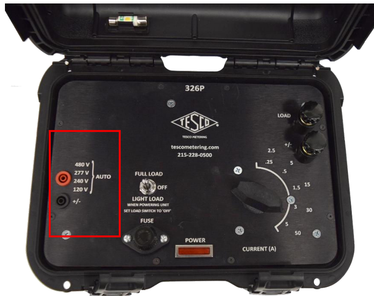
Figure 2.5.1 Voltage Input Connections on the unit.