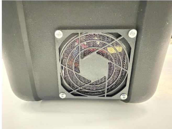
Figure 4.4.1 Cooling Fan for the 326P