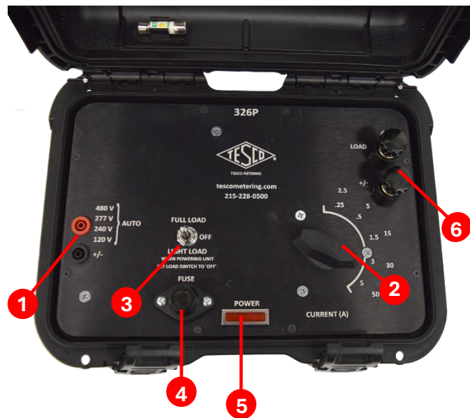
Figure 3.2.1 326P Front Panel