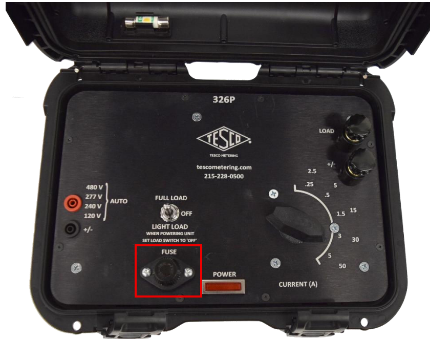
Figure 4.2.1 Panel Mounted Fuse