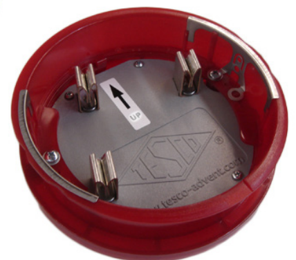
Top Right: Service Disconnect Adapter Catalog No. 251 and 252. Bottom Right: Service Disconnect Adapter Catalog No. 254