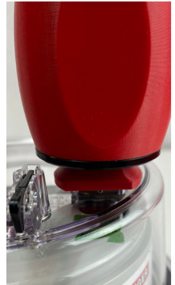
Cat. 1041-CN with Cat. 1039-WP