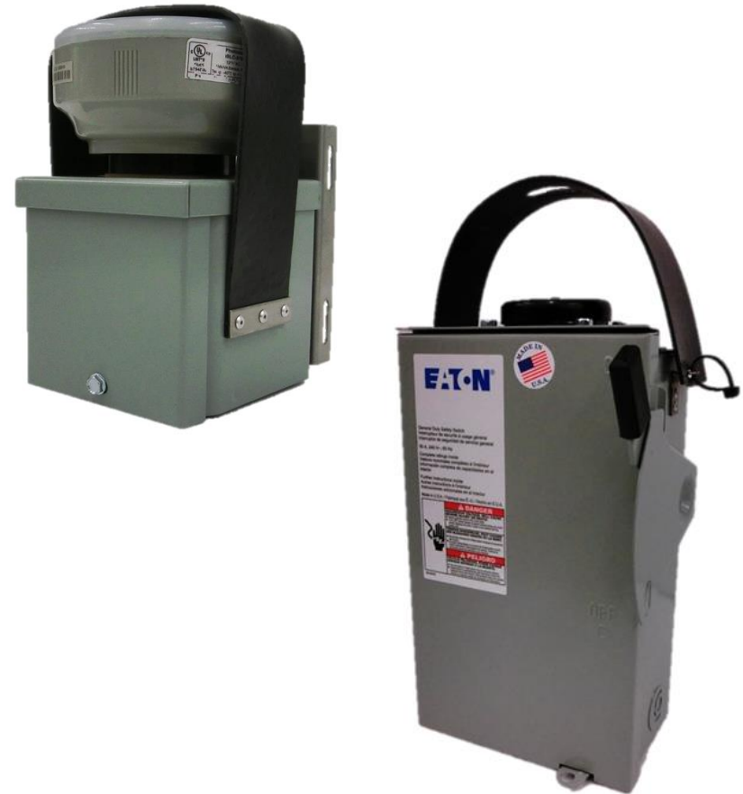
Cat. 701 (left) and Cat. 702 (right)

TESCO's SmartPole Meter Disconnect Box, Cat. 702 , combines the required fused disconnect switch along with the same socket and lockable security strap as the Cat. 701.