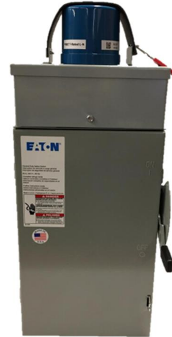
Cat. 703 with smart meter (not included)