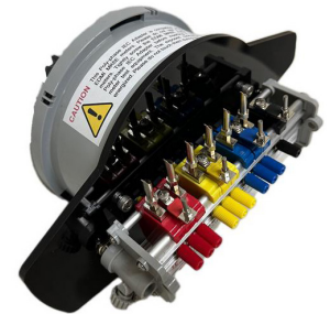
CAT. 1186-3 IEC Three Phase Meter Adapter