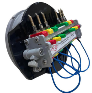
CAT. 1186-48A IEC Three Phase 48A Meter Adapter