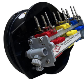
CAT. 1186-EDMI Three Phase EDM I Meter Adapter