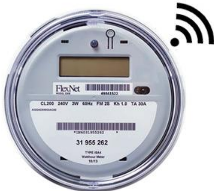
New Automated Meter