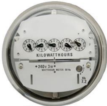
Old Electromechanical Meter