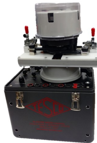
K-Base Adapter with Cat. 630 Closed-Link Field Test Kit (not included).