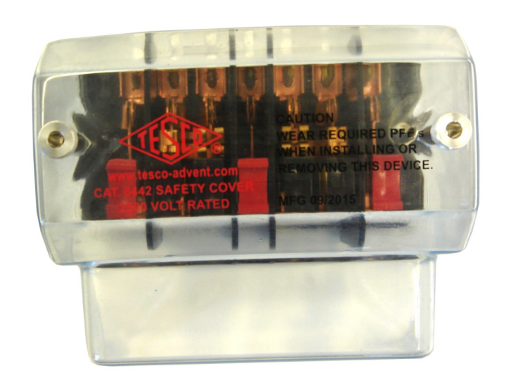
7-POLE TEST SWITCH PROTECTOR WITH CAPTIVE HARDWARE CATALOG NO. 6442-C