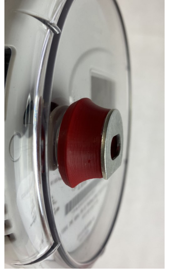
Cat. 1041-CN with Cat. 1039-WP Cat. 1041-HY