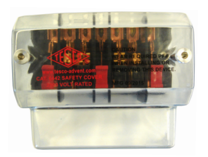
7-POLE TEST SWITCH PROTECTOR WITH CAPTIVE HARDWARE CATALOG NO. 6442-C

With safety always being a concern while working with electrical boxes, you can depend on TESCO's Test Switch Protectors (Catalog No. 6441 & 6442) to alleviate any uncertainty. This was developed to provide temporary protection of the test switch and to address the rising concern that the terminals of the test switch are exposed while you're working in the box. The test switch protectors can prevent incidental contact with live terminals or contact with tools.