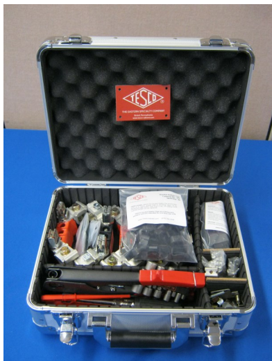
Pictured above: TESCO's Cat. 305 Pro Hot Socket Repair Kit.

Each kit can be replenished with Bulk Component Replacement Kits to suit your specific needs.