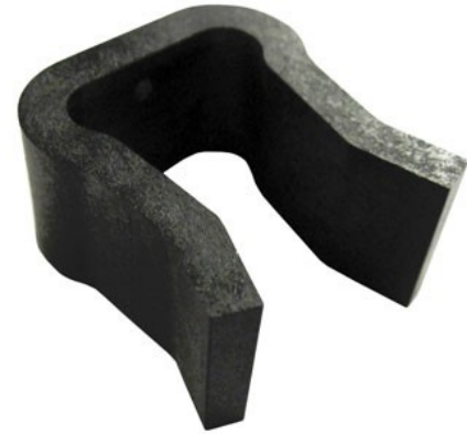
SOCKET SAFETY CLIP CATALOG NO. 301