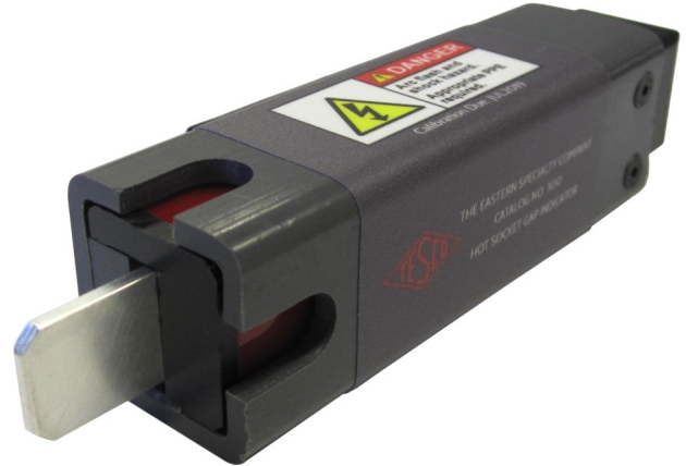
HOT SOCKET GAP INDICATOR WIDE BLADE CATALOG NO. 300

Note: If feasible, service should be disconnected. Regardless of whether the service has been disconnected or is live, personal protective equipment (PPE) should always be used while operating.