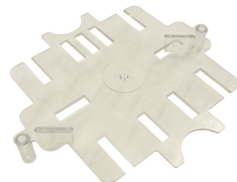
SERVICE DISCONNECT SHIELD CATALOG NO. 253

TESCO also offers a Service Disconnect Shield (Catalog No. 253), which gives meter technicians a quick visual indication of disconnected service by tilting the meter 45°. The Service Disconnect Shield is a cost effective way to safely and easily disconnect power, while leaving the meter on-site. The TESCO Service Disconnect Shield is for use with 1S & 2S Meter Forms only.