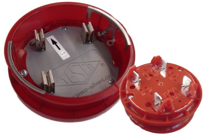
SERVICE DISCONNECT ADAPTER CATALOG NO. 254