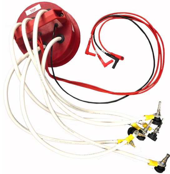
MTB CALIBRATION ADAPTER CAT. NO. 2450-CAL-30