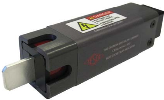
HOT SOCKET GAP INDICATOR WIDE BLADE CATALOG NO. 300

The TESCO Hot Socket Gap Indicator is used to determine if a meter socket jaw has become worn-out and unsafe for continued use. The Gap Indicator determines unsafe holding force on meter socket jaws based on laboratory testing.