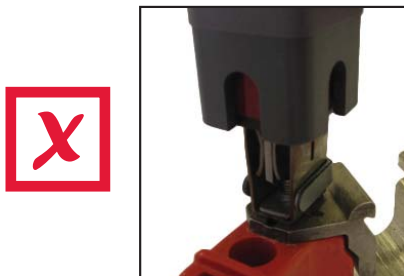
Red indication of a "bad" socket gap/loss of spring force.